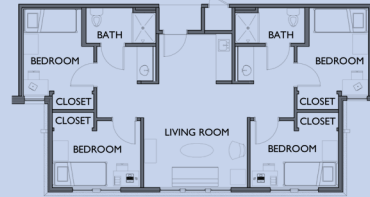
4-PERSON, 2-BATH SUITE, PRIVATE BEDROOM