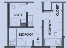
2-PERSON WITH BATH, PRIVATE BEDROOMS