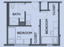
2-PERSON WITH BATH, PRIVATE BEDROOMS