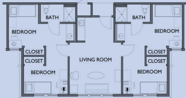
4-PERSON, 2-BATH SUITE